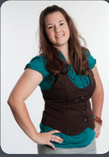
I was also blessed to have a great group of fellow interns to lean on." - 2010 graduate