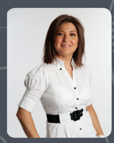
"My mentor and all of my preceptors have taught me so much about becoming a nutrition professional."