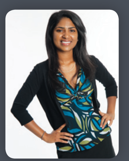
"The internship has increased my self-confidence in building towards becoming a dietitian." - 2010 graduate