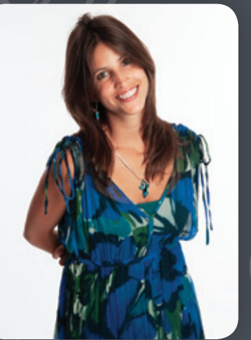
"I have learned that there really are good people who are willing to share their knowledge and expertise to help others achieve their goals." - 2010 graduate