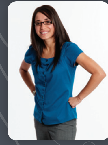
"I feel so lucky to have had the opportunity to learn from such a variety of dietitians, including our internship director and coordinators. - 2010 graduate

Many of the WIC directors around the state and country are registered dietitians. In local clinics, RDs conduct high risk counseling and nutrition education, supervise staff, and manage clinics.