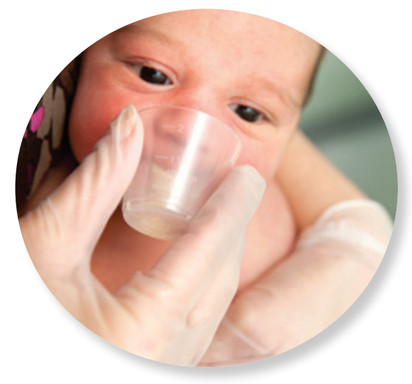
ASK TO SEE A LACTATION CONSULTANT.

After having your baby you may experience cramping during breastfeeding. It may feel like menstrual cramps or a milder version of the uterine cramping you experienced during labor. This is your uterus returning to its pre-pregnancy size. Cramping during breastfeeding will lessen as your body recovers.